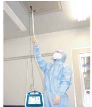
Climomaster™ probe for environmental measurements