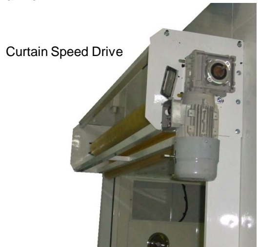
Curtain Speed Drive