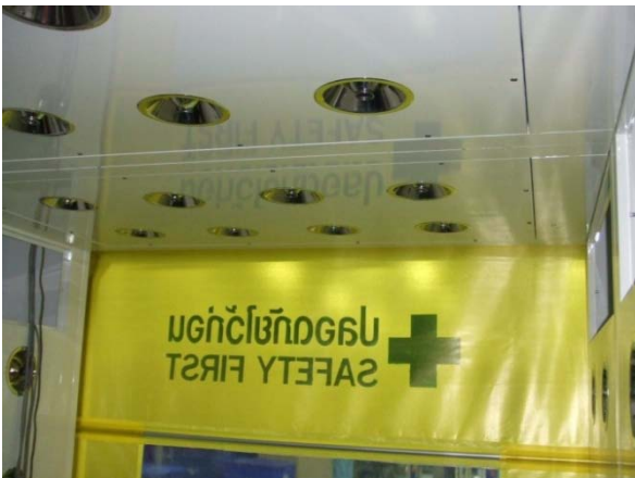
Air shower Interior

The shutter curtain also allows internal height up to 3 meters where conventional doors will be too cumbersome to be practical.