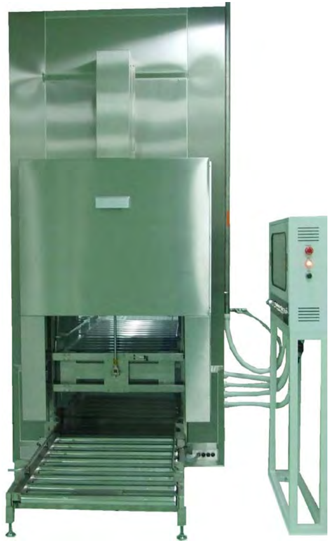
Dirty Room Side