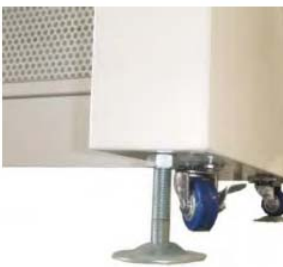
Wheel and Level Adjust