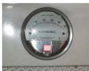
Pressure Gauge (optional)